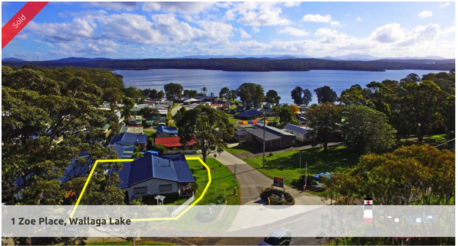
1 Zoe Place, Wallaga Lake