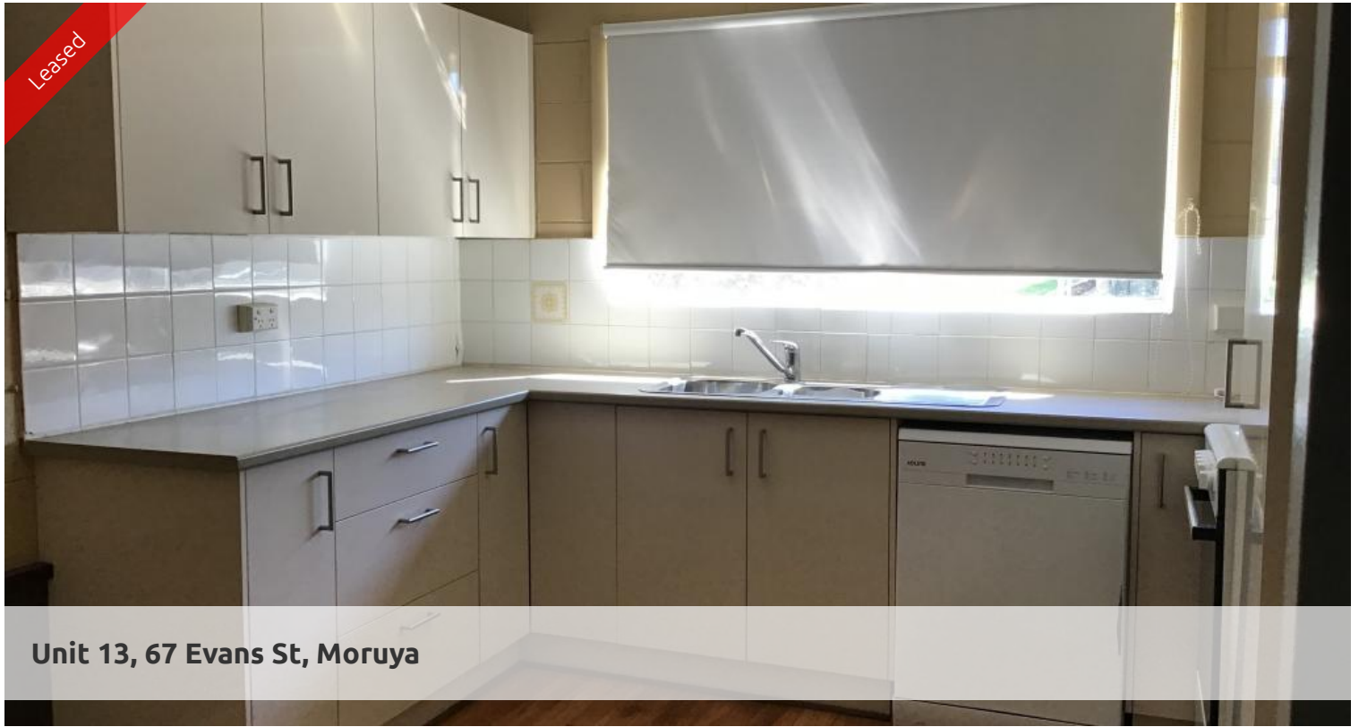
Unit 13, 67 Evans St, Moruya