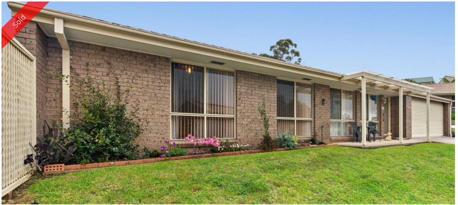
Unit 69, 11 Payne St, Narooma