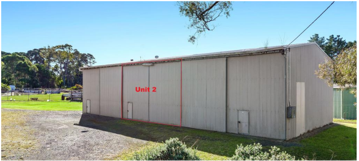
Unit 2, 17 Sherwood Rd, Bermagui