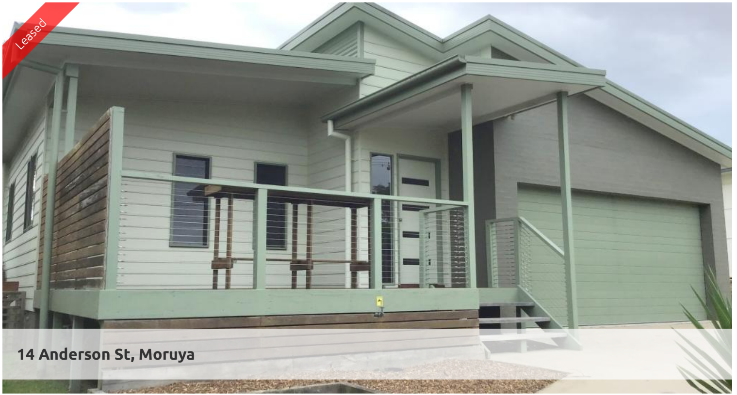
14 Anderson St, Moruya