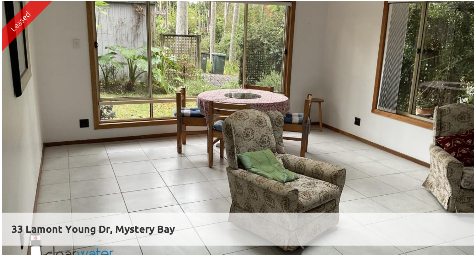
33 Lamont Young Dr, Mystery Bay