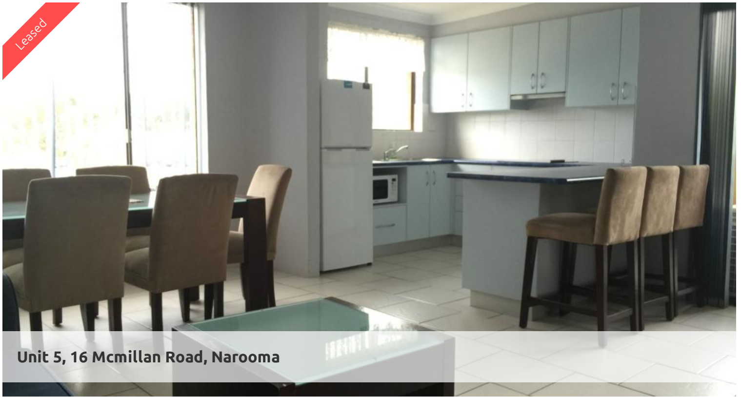
Unit 5, 16 Mcmillan Road, Narooma