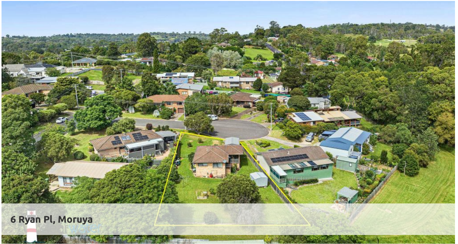
6 Ryan Pl, Moruya